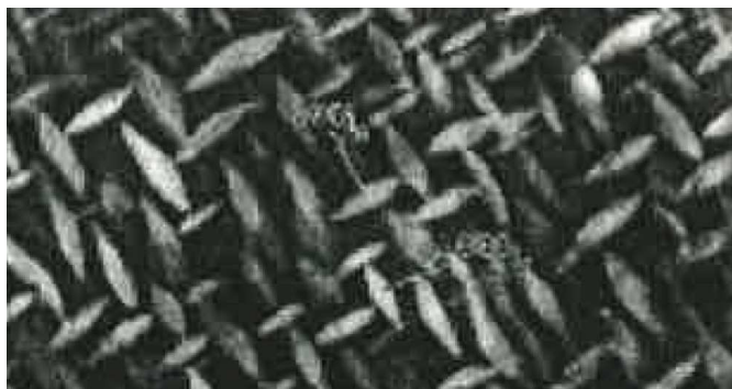
Electron Microscopic image of MSZ